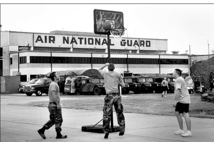
Army National Guardsmen from Illinois shoot hoops at the end of the day. They are among 2,500 National Guard troops who remain on the air station in Belle Chasse, which logs about 150 flights a day, almost all related to recovery operations.

3116 Sixth Street • Metairie • 504-833-5528